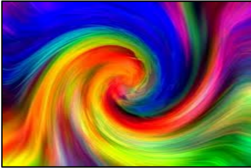
Express Yourself through Colour!